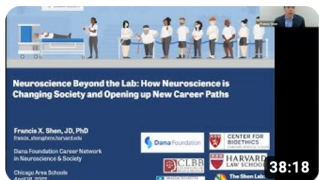
Career Network Events: Chicagoland

(Click to Watch) Achieving Your Action Potential in Chicagoland: A Sneak Peek at the NEW Dana Foundation Career Network in Neuroscience and Society