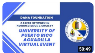
Career Network Events: UPR Aguadilla

(Click to Watch) University of Puerto Rico-Aguadilla: Neuroscience Beyond the Lab: How Neuroscience is Changing Society and Opening up New Career